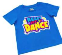
T SHIRT $25.00