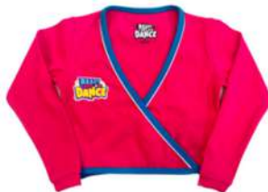
CROSS OVER $50.00