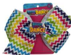
HAIR ACCESSORIES $15.00