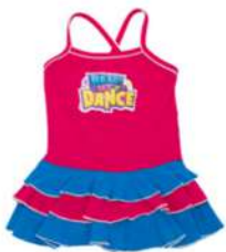
TUTU FRILL DRESS $60.00

All Ready Set Ballet students will be required to wear the official uniform that we are sure you will love. Below are the following options that can be purchased at reception.