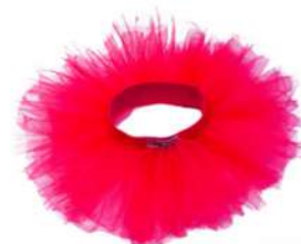
TULLE SKIRT $40.00